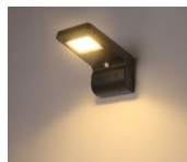
Dark test light